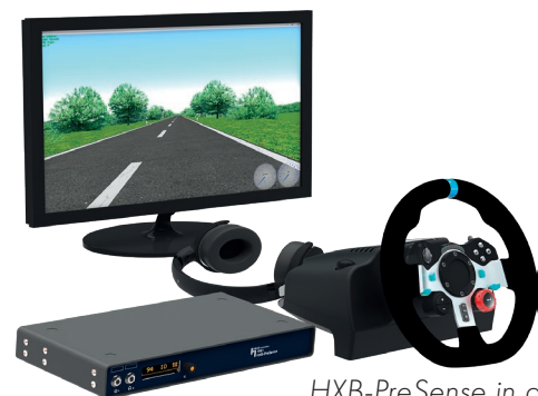
HXB-PreSense in a desktop simulation scenario with a steering wheel, headphones and the driving simulation running on a computer (cabling omitted)