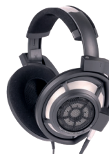
HD OP III.1