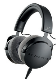
HD CL II.1