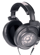
HD CL III.1

Available headphones for aurally-accurate and equalized playback with HXB-PreSense