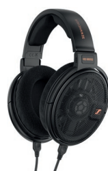
HD OP II.1

With HXB-PreSense, both headphones jacks can be calibrated for a specific headphones specimen and then feature the correct equalization filters for these headphones. In order to make sure that the correct pair of headphones is connected to a headphones jack, the serial number of the respective headphones specimen is noted above the headphones jack.