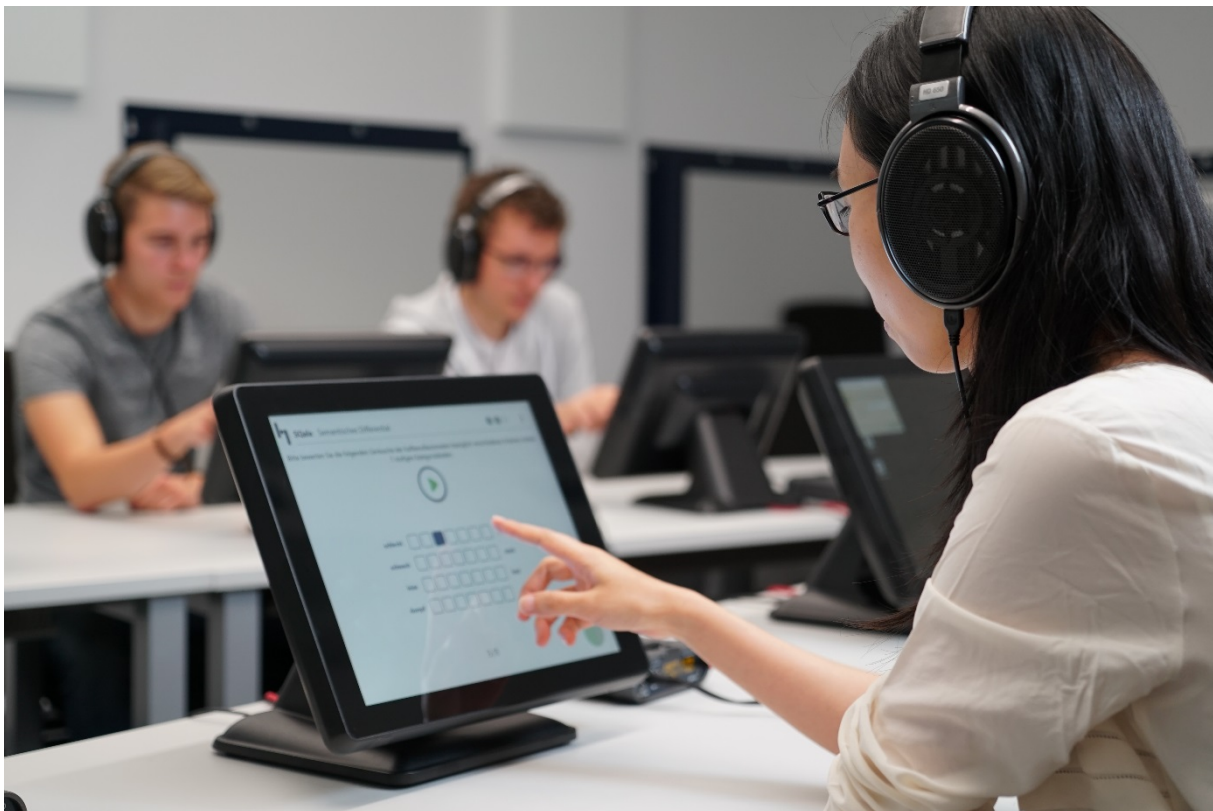
Jury Testing: SQala within ArtemiS SUITE 10.0.